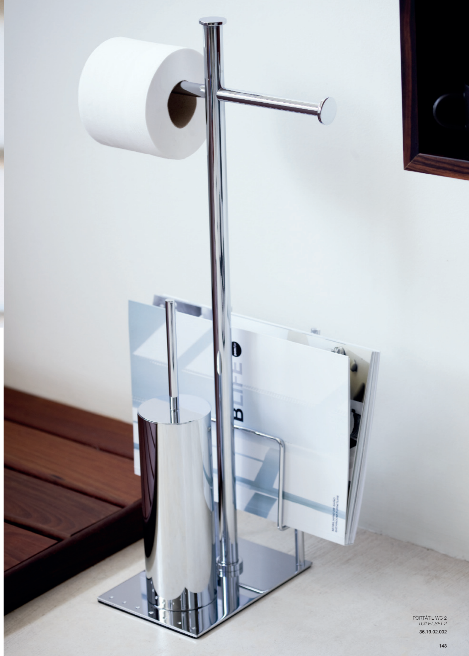
PORTÁTIL WC 2 TOILET SET 2 36.19.02.002