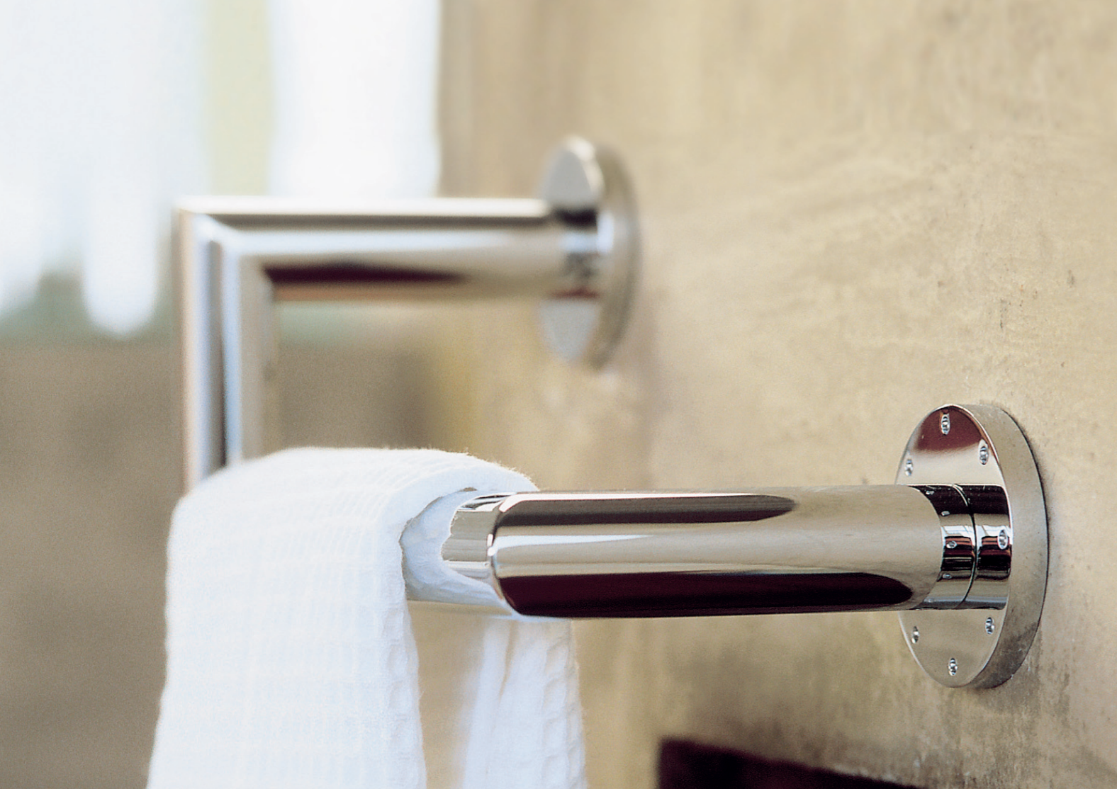
ARGOLLA 2 TOWEL RING 2 36.20.56.002