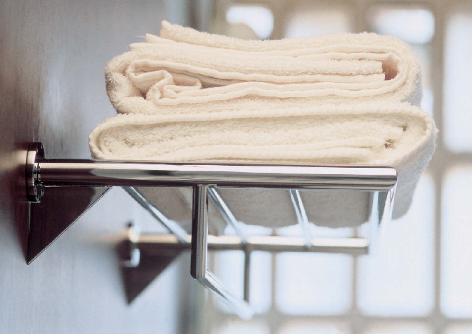
ESTANTERÍA TOALLAS TOWEL RACK 36.51.10.002