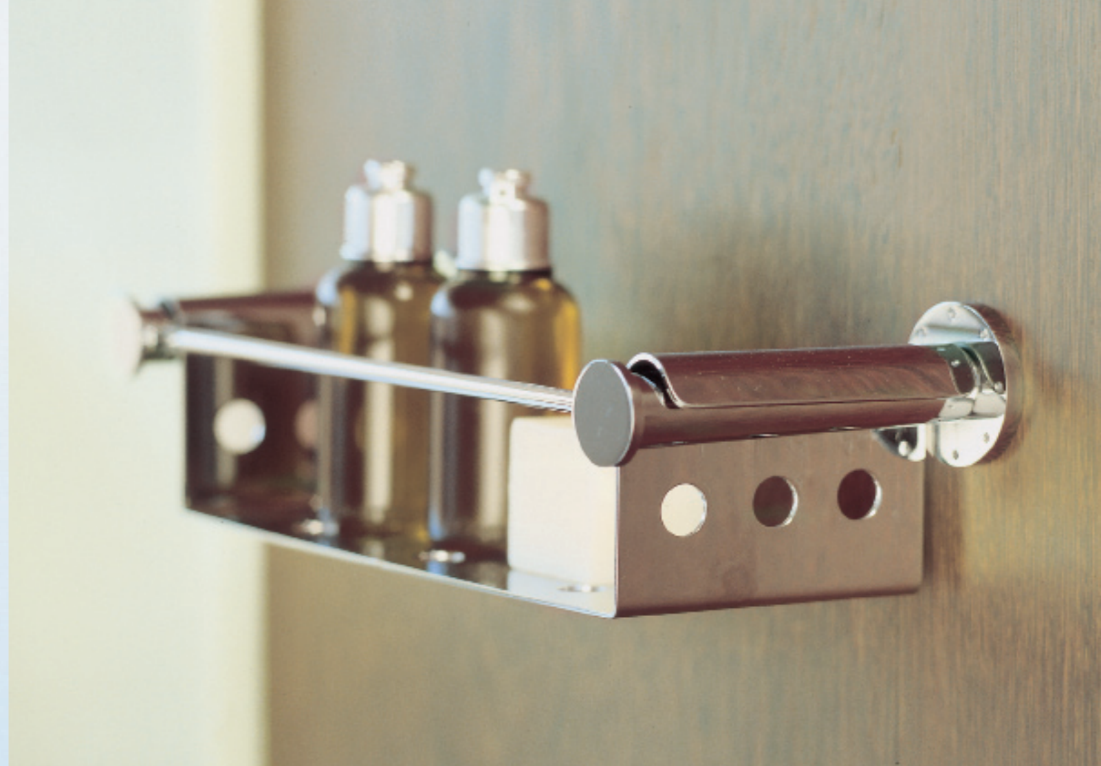
JABONERA SHOWER SOAP DISH 36.60.20.002