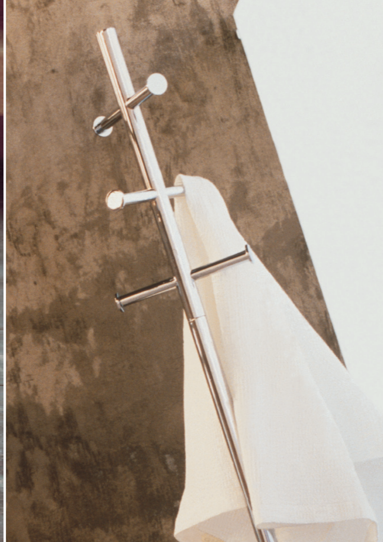
COLGADOR DE PIE FREE STANDING TOWEL ROBE 36.31.01.002