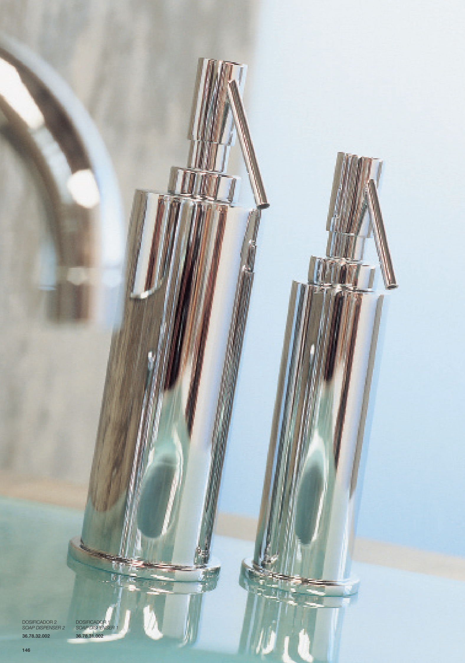
DOSIFICADOR 2 SOAP DISPENSER 2 36.78.32.002