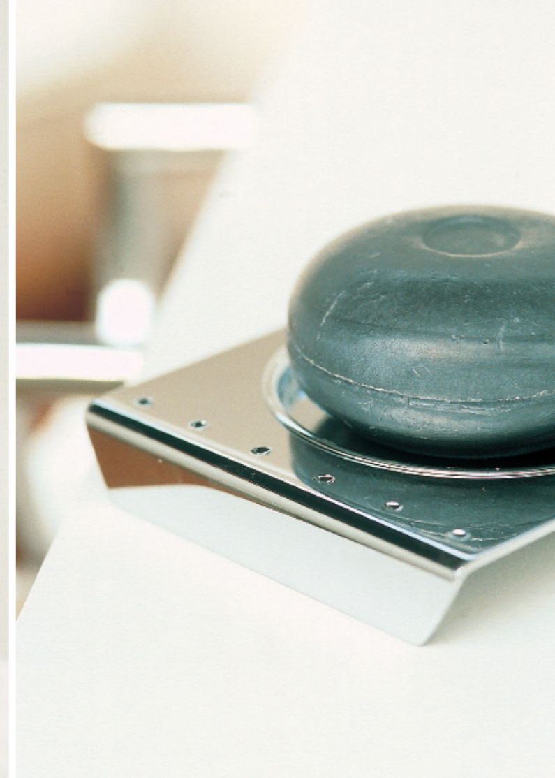
JABONERA SOAP DISH 36.60.50.002