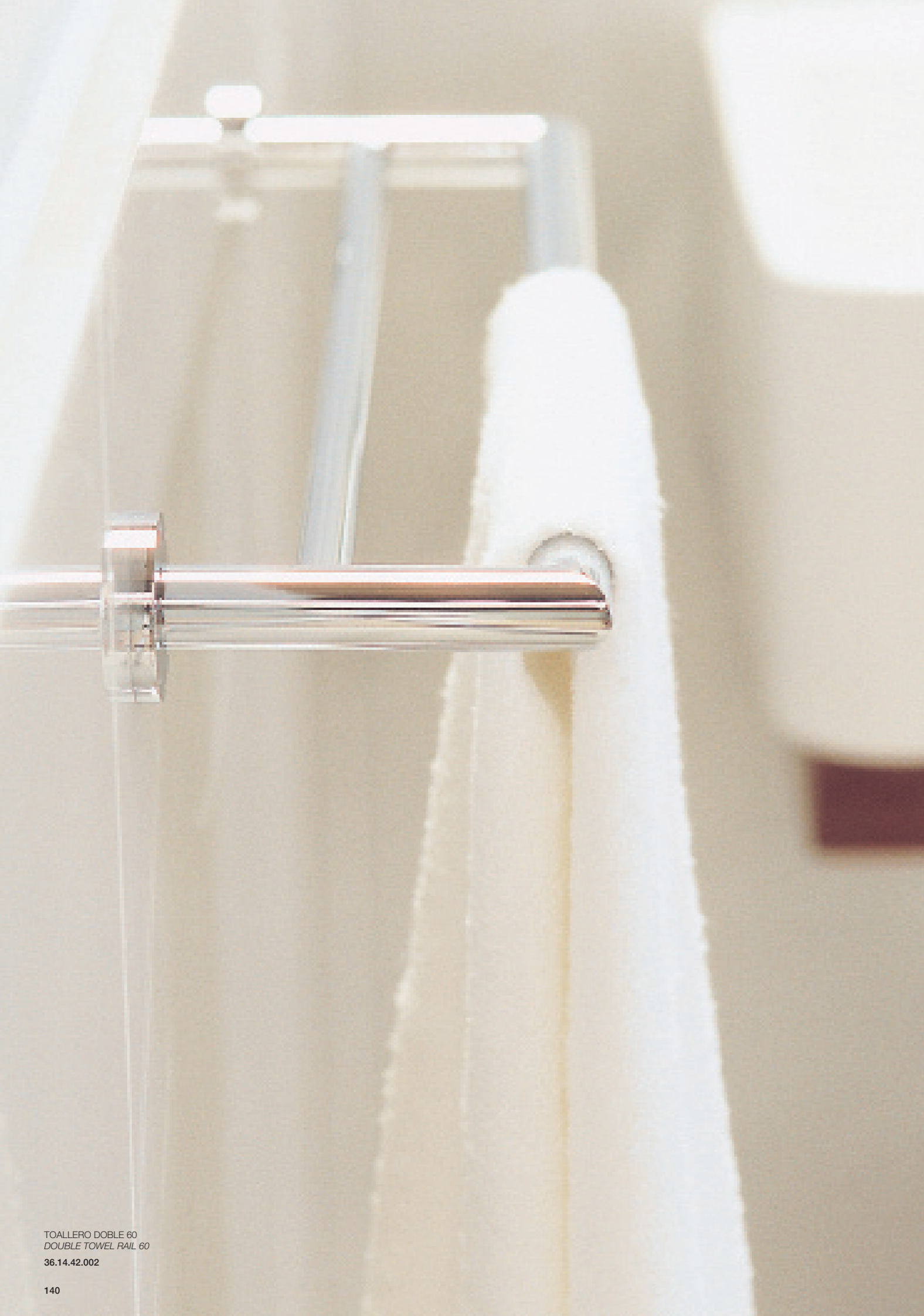
TOALLERO DOBLE 60 DOUBLE TOWEL RAIL 60 36.14.42.002