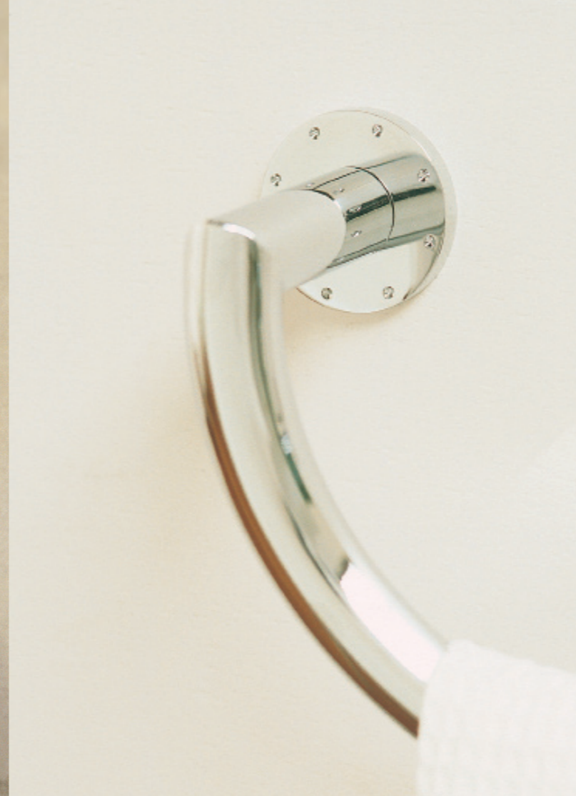
ARGOLLA 1 TOWEL RING 1 36.20.55.002