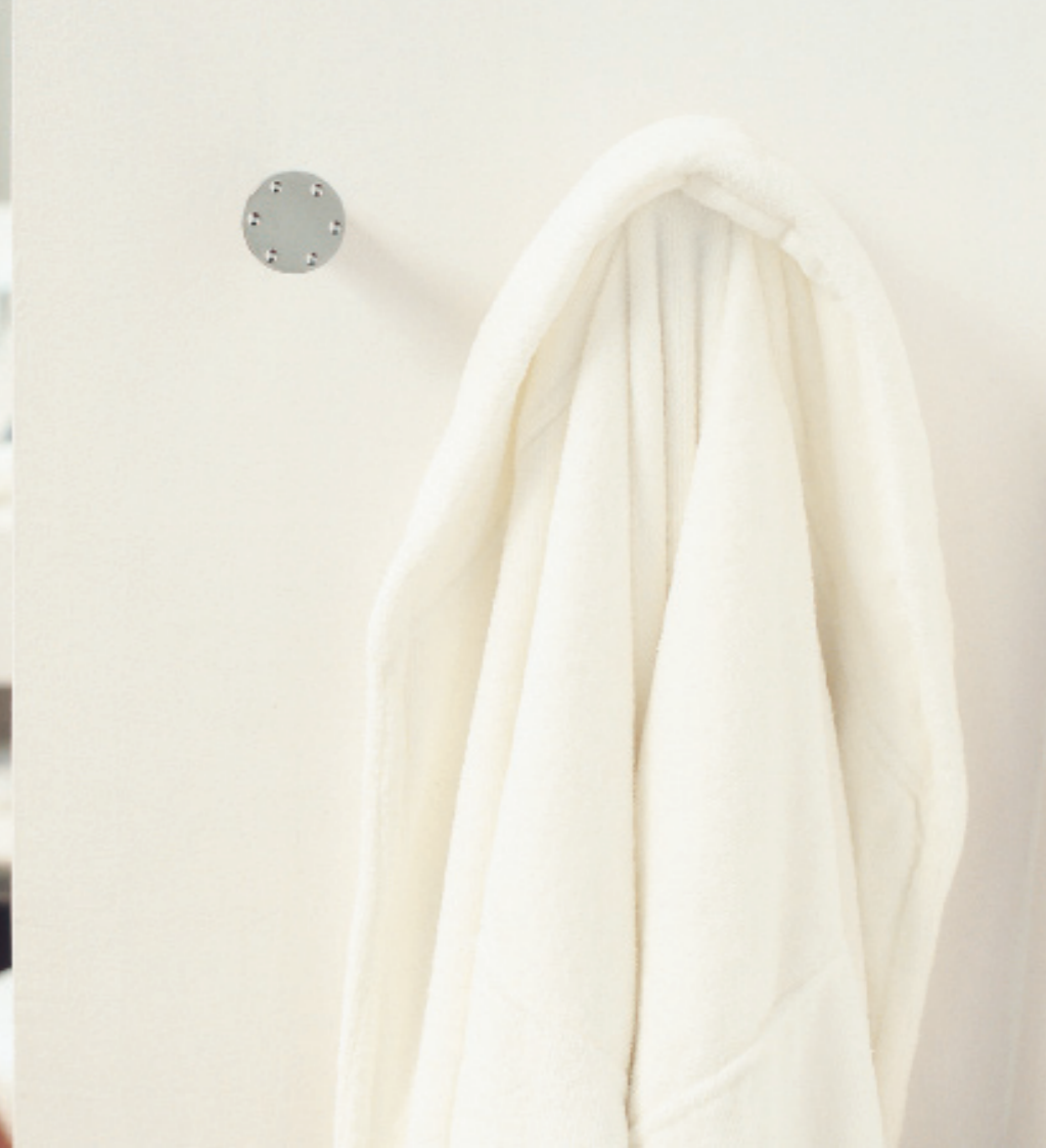
COLGADOR 1 HOOK 1 36.30.11.002