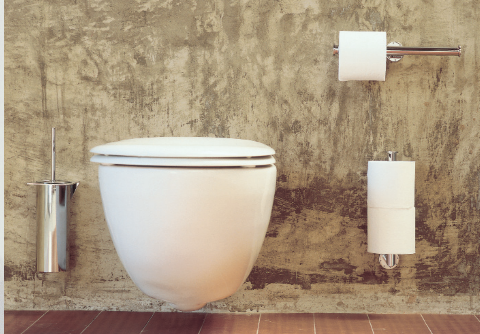
ESCOBILLERO PARED WALL TOILET BRUSH HOLDER 36.90.01.002